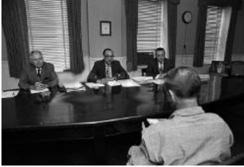
"Elderly Pilot Program" Cont...

(d) The court shall consider the petition in its entirety and may not order the release of the committed person if the court finds that the committed person poses a threat to public safety. If the court determines that a committed person is eligible for a sentence adjustment under this Section and determines that the committed person should receive a sentence adjustment the court shall set the conditions for the committed person's release from prison before the expiration of the committed person's sentence imposed by the sentencing court.