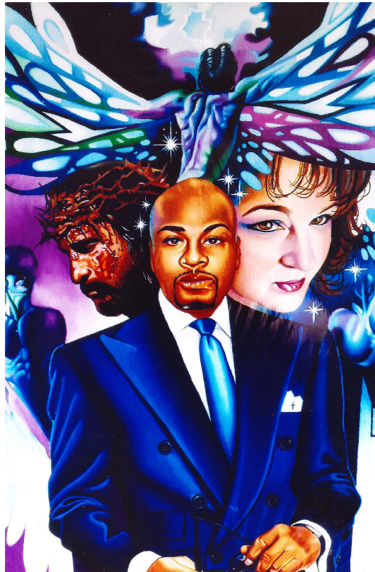
Painting by Irving Ramey

by the federal government and most states. Instead, the Department of Corrections has defined "capacity" to include anywhere they have a bed. So if there is one empty bed on the floor of the infirmary, we are under capacity. That definition is buried in a footnote to a footnote on the Department's website. Each prison on the website reports that it is under capacity, with a footnote: "As of 5/31/2013. Reflects bed space capacity analysis as outlined in the July 1, 2013 Quarterly Report to the Legislature." If you go to that Quarterly Report ( http://www2.illinois.gov/idoc/reportsandstatistics/Documents/IDOC_Quarterly%20Report_Jul_%202013.pdf ) Footnote 1 to Table 4 in that report reads: "Operational Capacity/Bed space is the maximum number of inmates a facility can hold."